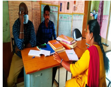
Exposure Training from SINAM