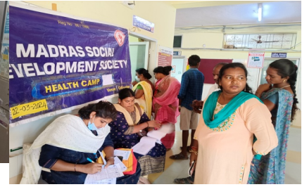
Health Camp at Gudiyatham GH