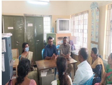
Discussion with DPM at ART Centre