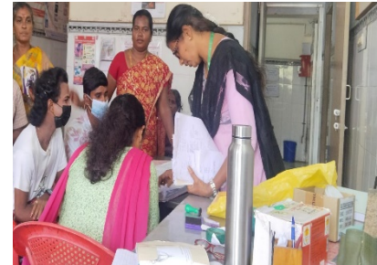
PE Selvi bringing target to GVMCH for ICTC/RMC test