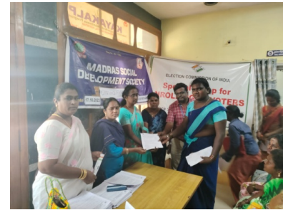
Community event at Gudiyatham GH