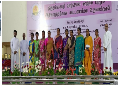
Skill training: Basic English Coaching