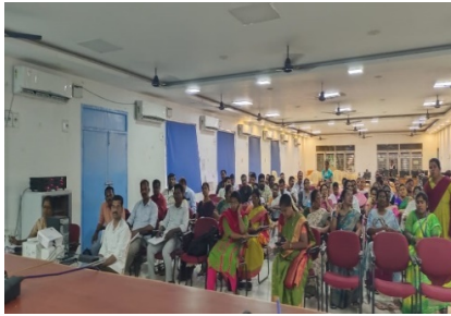
Review Meeting at DAPCU

The DAPCU holds monthly review meetings with all NACP facilities in the district. Key focus areas: reviewing and validating monthly reports, evaluating facility operations, reviewing referrals and linkages, and assessing the status of social welfare benefits for PLHIV and HRGs.