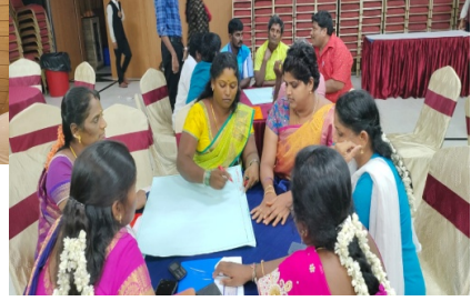
PE Training — Kshamta Kendra