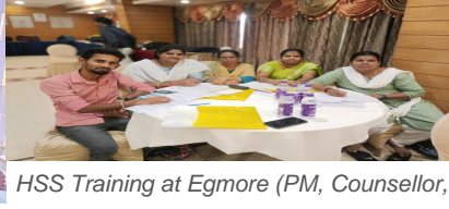
HSS Training at Egmore (PM, Counsellor, Lab Tech)