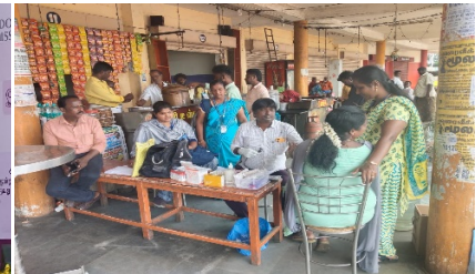
CBS Camp — Kaveripakkam