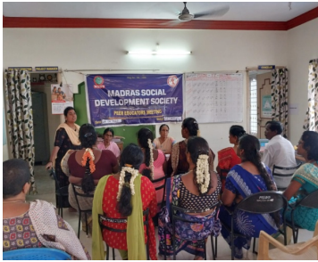
Peer Education Meeting at MSDS

Peer educators are selected by their peers with support from the project staff. They act as change agents, working to transform unsafe behaviors into safer practices. From April 2023 to March 2024, 13 peer educators were engaged in the program, attending 12 review meetings held at the project office in Katpadi, Vellore.