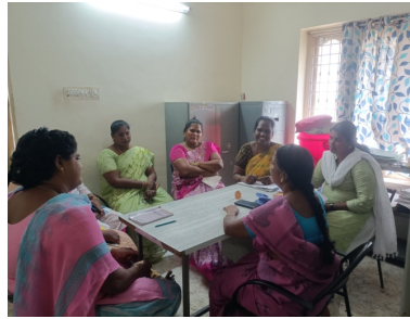
Monthly Staff Review Meeting conducted by MSDS PD