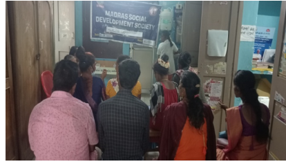
Health camp at Arcot GH