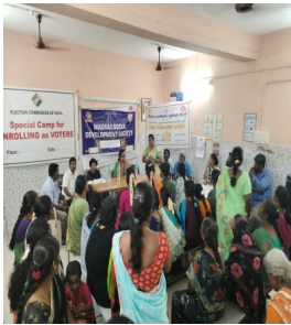
Community event at Thiruvalem

A Community Get Together event was organized for FSWs, MSMs, and TG individuals in all 10 target blocks at DSRC Centers. A total of 425 community members participated across different locations.