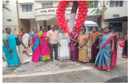
World AIDS Day with Executive Secretary — MSDS