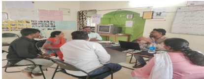
Evaluation team discussion in presence of PD, DS, Staff