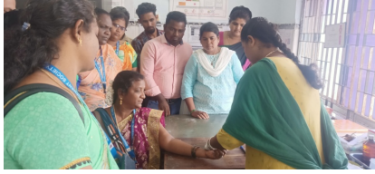
CBS Camp Training at GVMCH