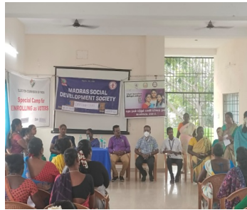
Community event at Walaja GH