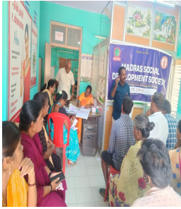
Health Camp at Arakkonam GH